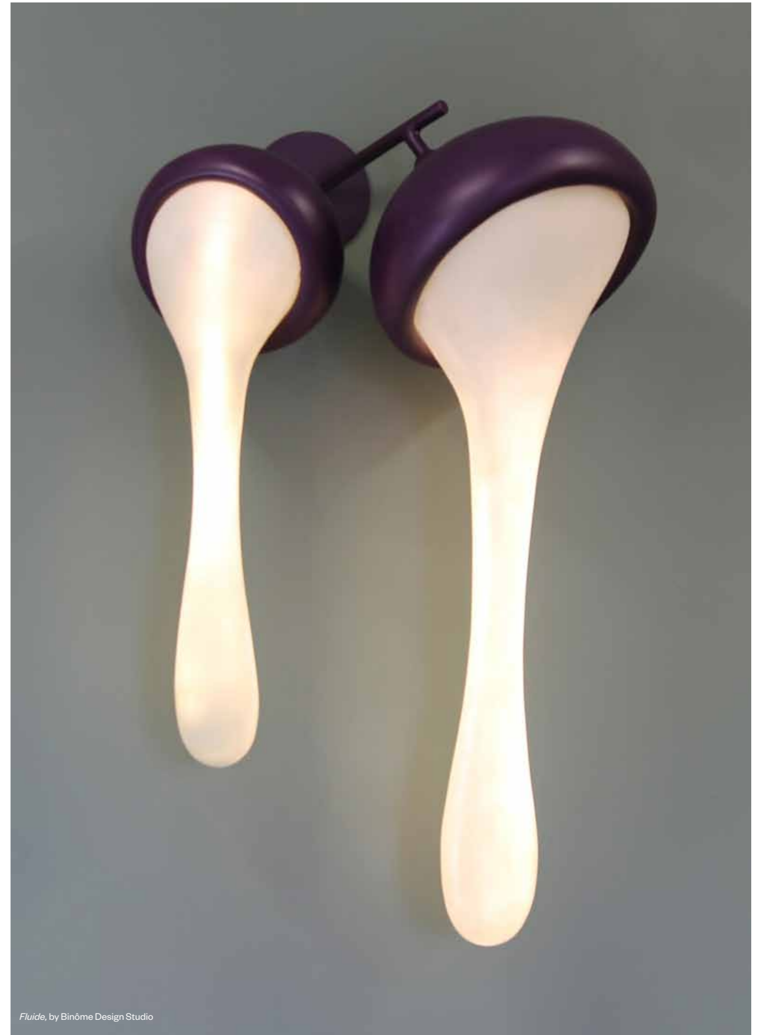
Fluide, by Binôme Design Studio