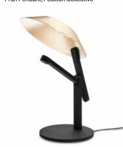
Hammer lamp, Wiener Silber