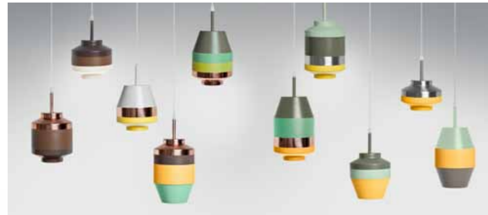
Pran Pendant, Position Collective