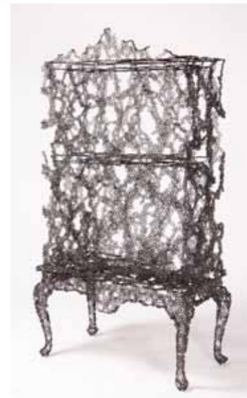
Temporality cabinet, Gallery Fumi