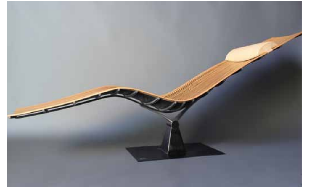
Atelier Rouge Cerise, Cities