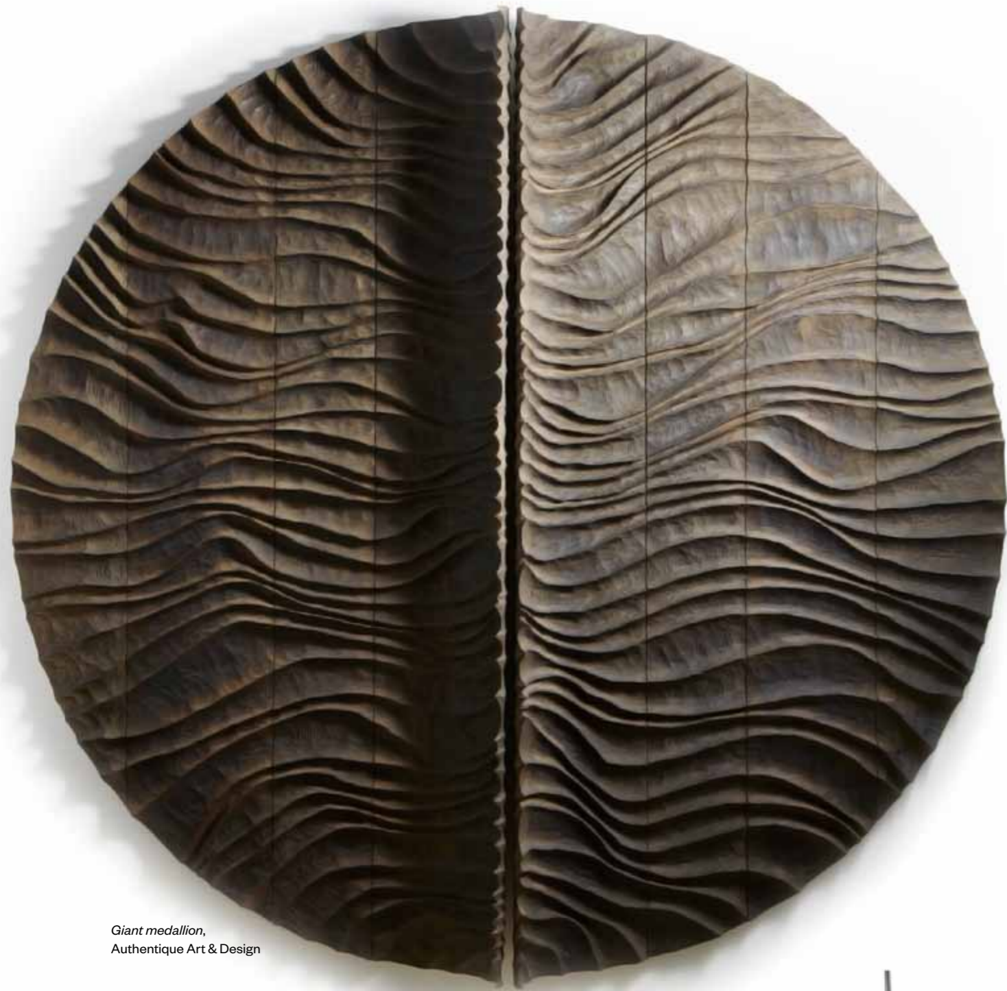
Giant medallion, Authentique Art & Design