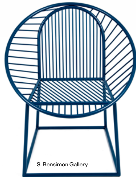
S. Bensimon Gallery