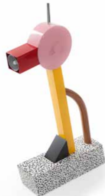
Tahiti lamp by Ettore Sottsass, Ardeco Gallery

Design Days Dubai's fourth edition will showcase the work of cutting-edge, limited-edition collectible designers, host global premieres for international designers and galleries, and top awards and honours for regional talent.